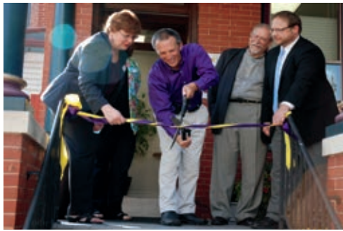
Celebrating the opening of our new Lancaster office!

Neffsville Mennonite Church $ ♥ New Holland Mennonite Church New Joy Church New London Presbyterian Church $ Oasis Christian Fellowship $ Ridgeview Mennonite Church F ♥ Rossmere Mennonite Church $ Sacred Heart Catholic Church Sandy Hill Community Church $ Set Free By the Word Ministries St. Andrew's Episcopal Church $ ♥ St. James' Episcopal Church St. John's Center United Church of Christ $ St. John's Episcopal Church, Compass $ ♥ St. Joseph Church, Downingtown $ St. Joseph Church, Lancaster $ St. Matthew's United Church of Christ $ St. Michael Lutheran Church $ St. Norbert Catholic Church ♥ St. Paul Evangelical Lutheran Church $ St. Paul's Baptist Church $ St. Paul's Episcopal Church $ St. Paul's Lutheran Church $ St. Peter Parish Strasburg Mennonite Church ♥ Stumptown Mennonite Church $ Tel Hai Chapel $ United Church of Christ East Goshen ♥ United Methodist Church of West Chester $ Upper Octorara Presbyterian Church $ Vineyard Community Church ♥ Wayside Presbyterian Church ♥ West End Mennonite Fellowship $ Westgate Baptist Church $ Westminster Presbyterian Church $ Willowdale Chapel Worship Center (2) ♥ Zion Evangelical Lutheran Church ♥