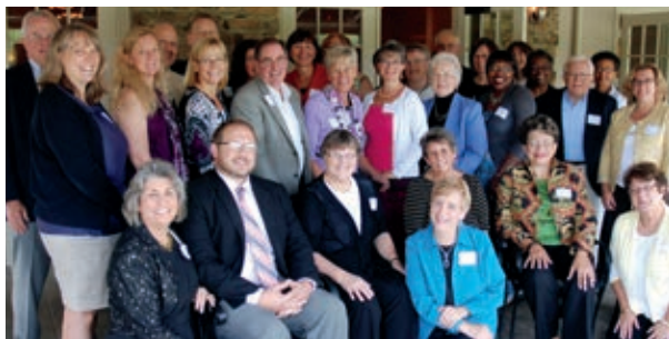
Past and current board members celebrating our 25th Anniversary at the Founders' Day event