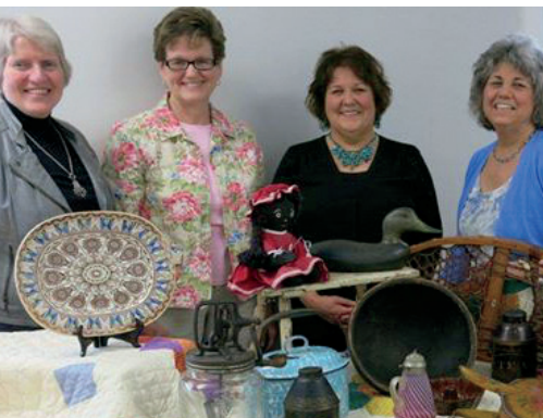
Our Lancaster County spring event committee with all their treasures!

VDL Enterprises, Inc.- DBA University Painters Weierbach Prosthodontist, PC Witmer's Tree Service