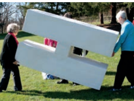
Bridge of Hope staff creatively displaying HOPE in the local community!